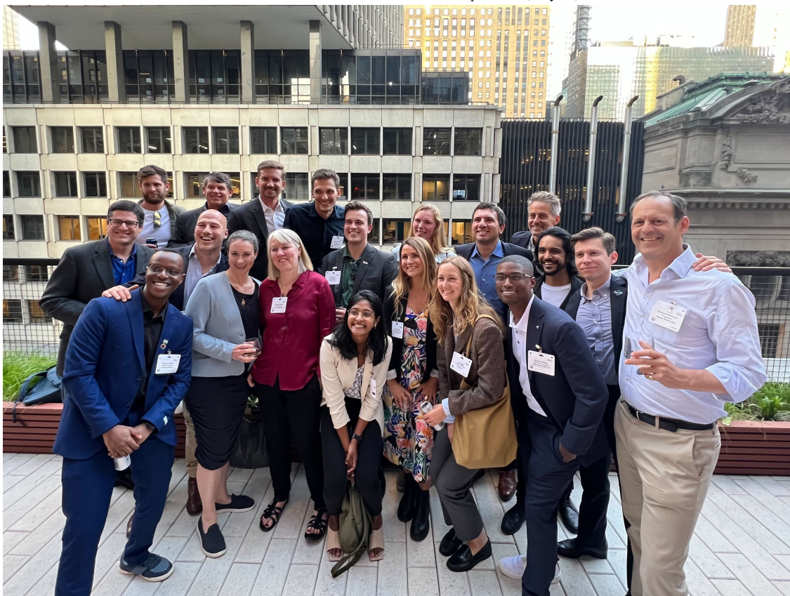
DAC Coalition Community Photo at Carbon Unbound New York